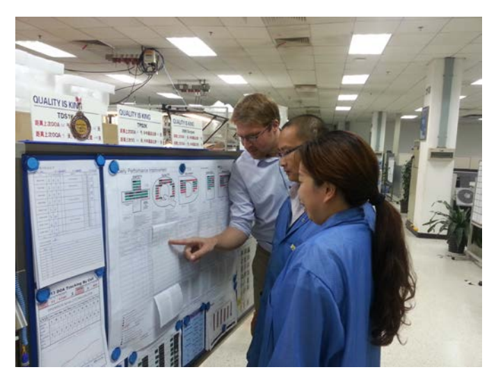
Tektronix quality improvement teams continuously monitor progress towards lower field failure rates

Calibration plans for your Tektronix and non-Tektronix equipment. On-line scheduling and tracking tool, 24/7.